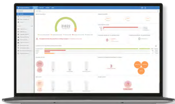
Figure 1: Main Panda Adaptive Defense Dashboard.